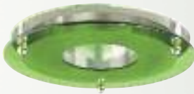
Luminous Disk Open Catalog No. LDO Shown in Green Also available in: Clear, Blue, Red