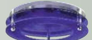
Luminous Rings Catalog No. LR2 Shown in Blue Also available in: Clear, Red, Green