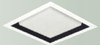
Drop Opal Lens Catalog No. DO (Shown with Baffled Splay)