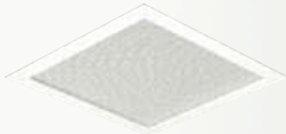
C73 Lens Catalog No. C73