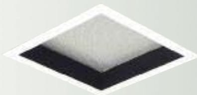
Baffled Splay Catalog No. BS (Shown with C73 lens)