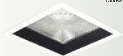
Fresnel Lens Catalog No. FF (Shown with Baffled Splay)