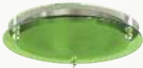
Luminous Disk Catalog No. LD Shown in Green Also available in: Clear, Blue, Red