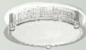
Perforated Shield Catalog No. PFS Shown with white perf and clear LD. Available in conjunction with the LD, LDO or LR options.