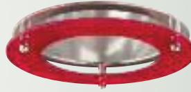
Luminous Ring Catalog No. LR Shown in Red Also available in: Clear, Blue, Green